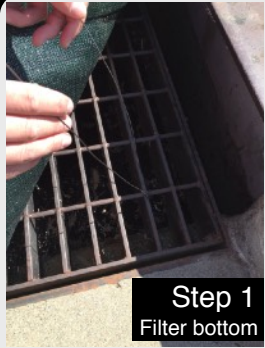
Step 1 Filter bottom

The AGG 2 Filter is useful in drain inlet protection when an under-grate filter, such as the YellowJacket or Hornet's Nest filter, is not feasible. Ideal for combo drain inlets and surface only drain inlets. Built into each unit is an overflow portal to allow faster flow-thru during heavy storm events. The AGG 2 Filter can either be held in place with gravel bags or the preferred method of attaching unit to the grate with heavy duty wire.