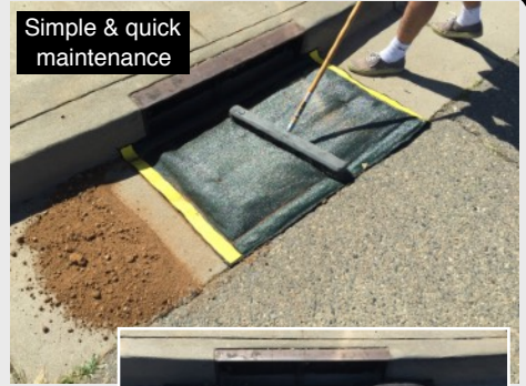
Simple & quick maintenance