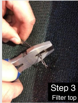
Step 3 Filter top